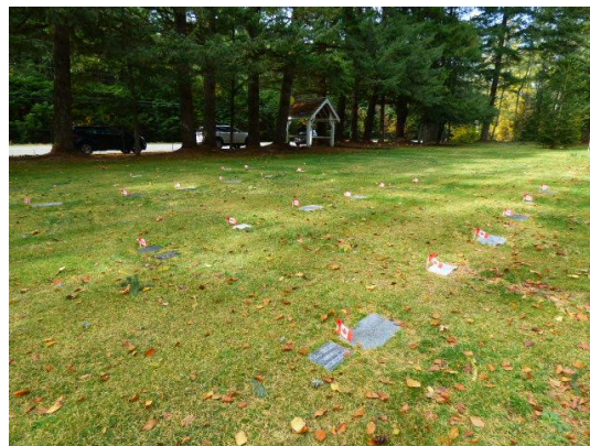
RCL Diamond Head Branch 277 "Legion Plots" in Block 14, 28 & 29 (40 plots)